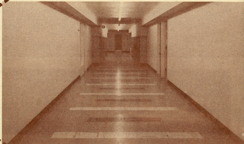
Corridor - 1st floor